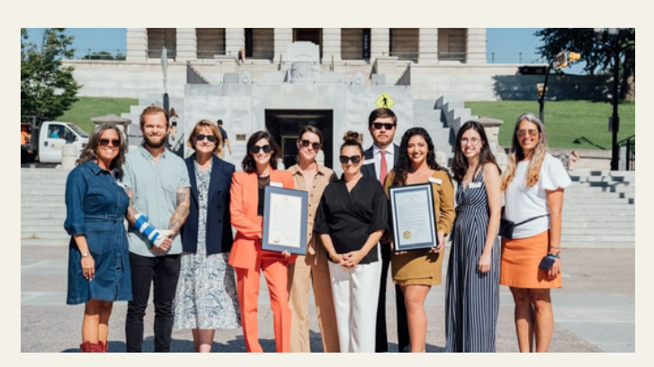
September 27, 2021 Tennessee Proclamation Day